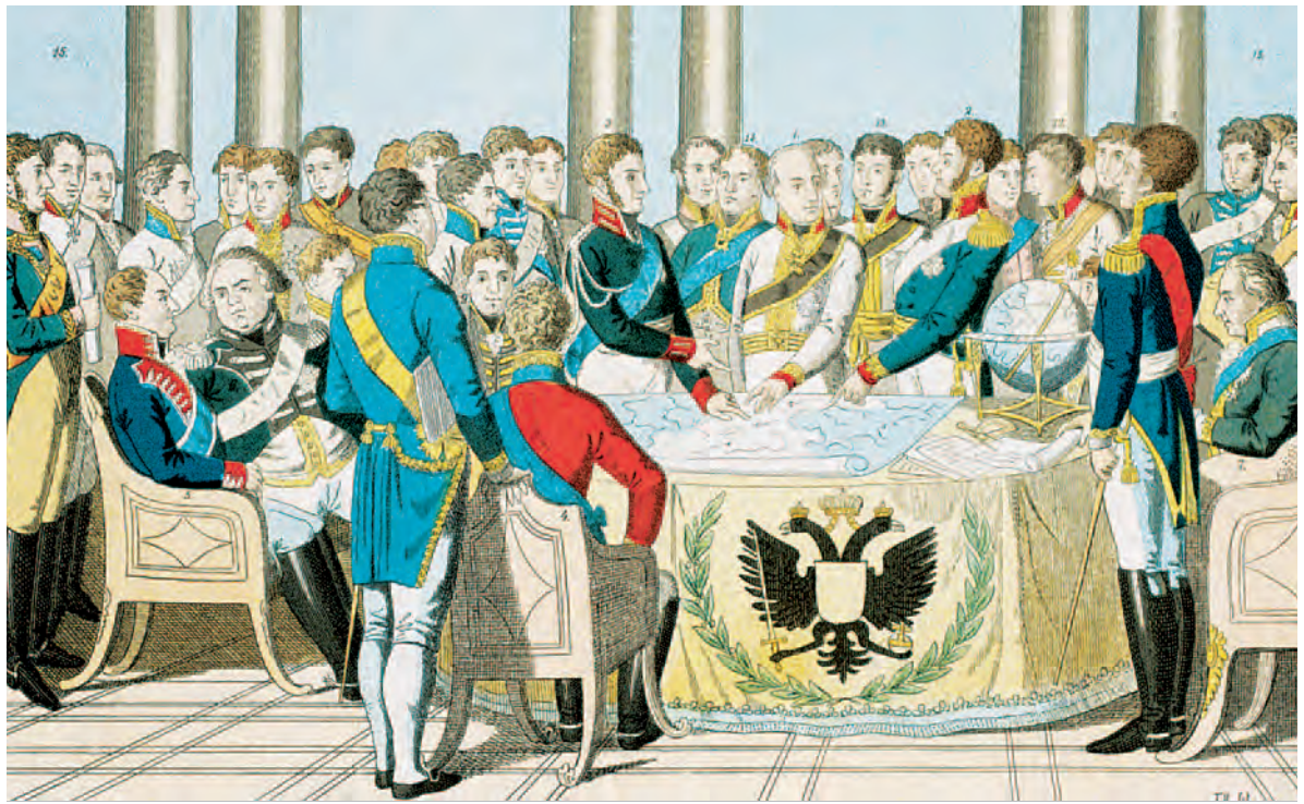
▲ Delegates at the Congress of Vienna study a map of Europe.

These changes enabled the countries of Europe to contain France and prevent it from overpowering weaker nations. (See the map on page 240.)