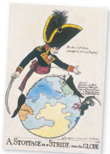
▲ "Little Johnny Bull"—Great Britain—waves a sword at Napoleon as the emperor straddles the globe.