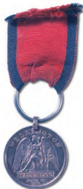
▲ British soldiers who fought at the battle of Waterloo received this medal.

Without doubt, Napoleon was a military genius and a brilliant administrator. Yet all his victories and other achievements must be measured against the millions of lives that were lost in his wars. The French writer Alexis de Tocqueville summed up Napoleon's character by saying, "He was as great as a man can be without virtue." Napoleon's defeat opened the door for the freed European countries to establish a new order.